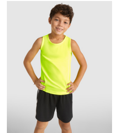
ANDRE KIDS K0350