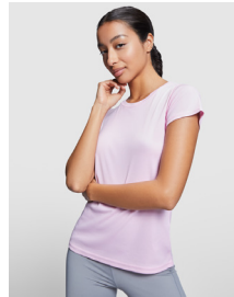
MONTECARLO WOMAN R0423